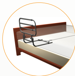
Safety Strap Holds You and the Rail in Place