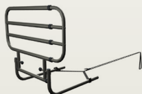
Slide on Strap