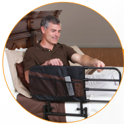
Extends 24-42 inches