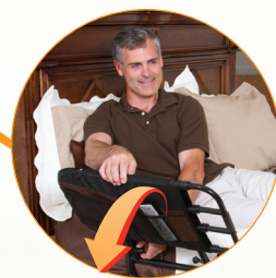
Pivots 180° Down