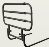
Attach L Shaped Tubes