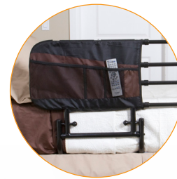
Includes a Bonus Organizer Pouch