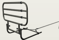
Attach Rear Crossbar