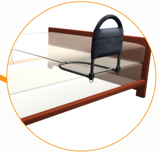
Safety Strap Holds the Rail in Place