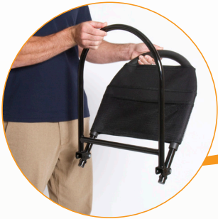
Folds for Travel or Storage