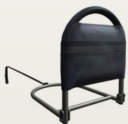
Open Bed Rail