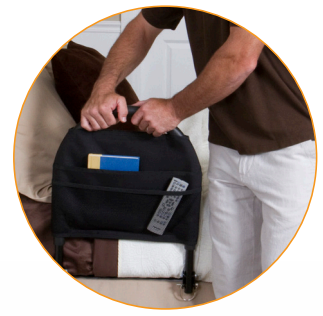
Excellent for Bariatric Use Supports Over 400 lbs