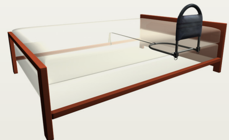
Secure to Bed Frame with Included Safety Strap