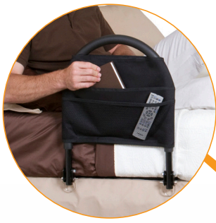
Includes a Bonus Organizer Pouch